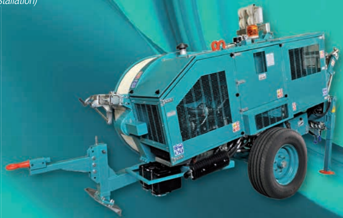
Hydraulic tensioner-puller 4.500 daN