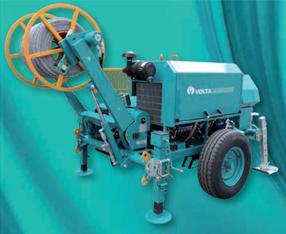
Combined hydraulic winch 3.500 daN (fit for underground and overhead lines installation)