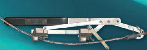
Tensioner Tirvit for ropes \varnothing up to 8 mm