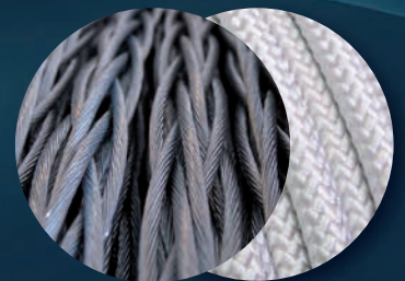
Antitwisting steel and polyester ropes