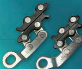
Come Along Clamps for copper and steel wire