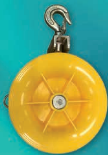
Cable stringing pulleys made of Nylon