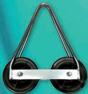
Double pulley block for stringing overhead conductors