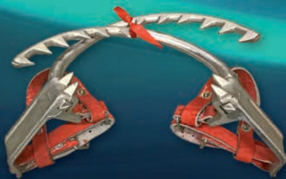
Aluminium Pole climbing irons