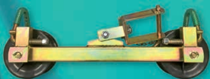
Tandem Medium Voltage pulleys