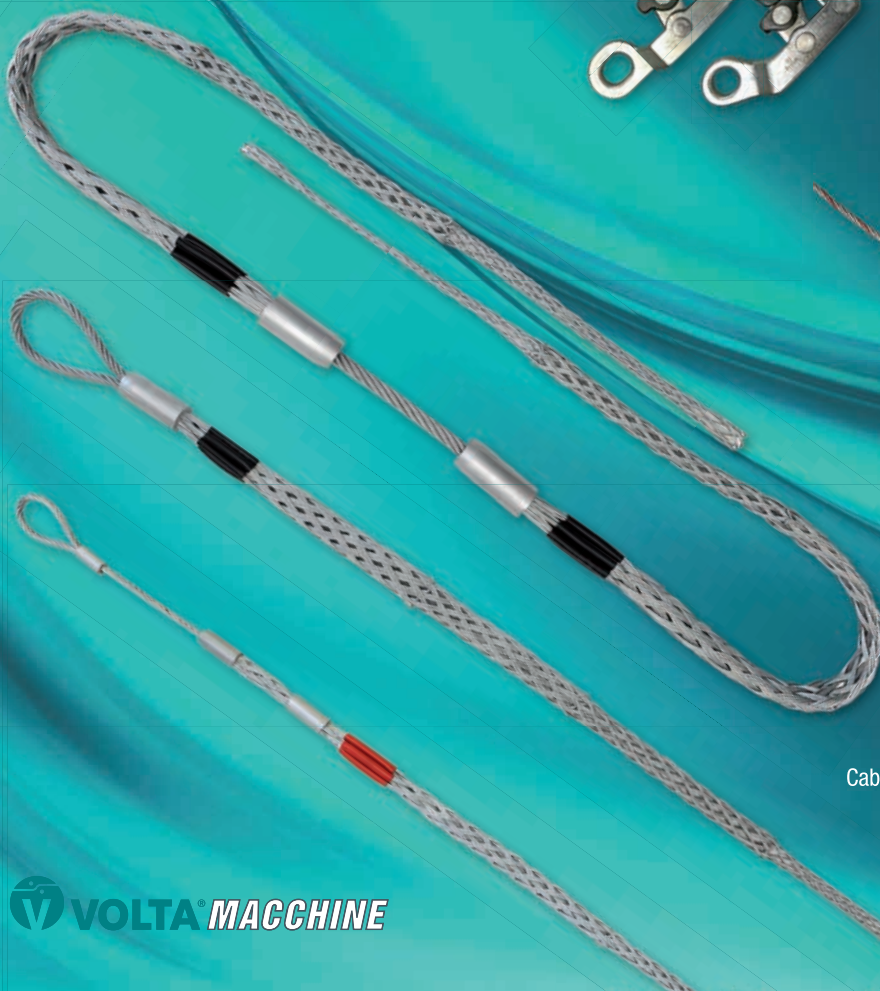
Cable pulling grips for stringing of aerial conductors