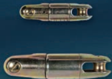
Antitorsion swivel joint articulated type